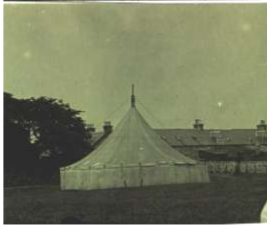
The original pavilion