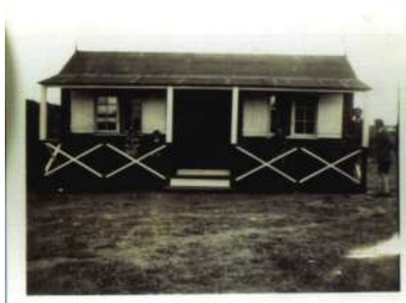
The second pavilion opened in 1913