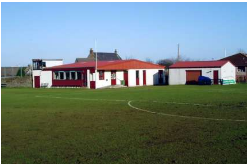
Clubhouse with score board and scorer's box top left and store building to the right in 2009