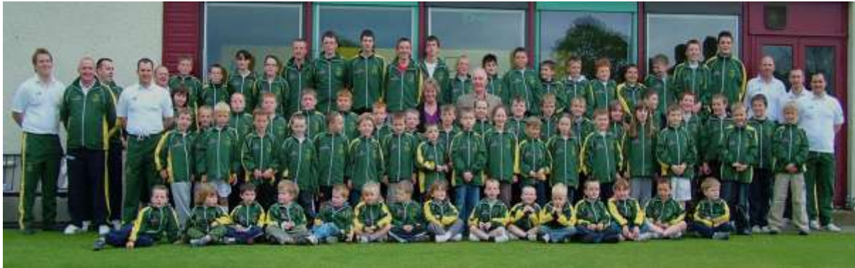
All the Freuchie Junior Teams and coaches in 2008