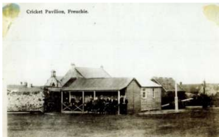
The extension to the second pavilion, which included a tearoom and toilets, was opened by Major Lumsden on 3 rd May 1924